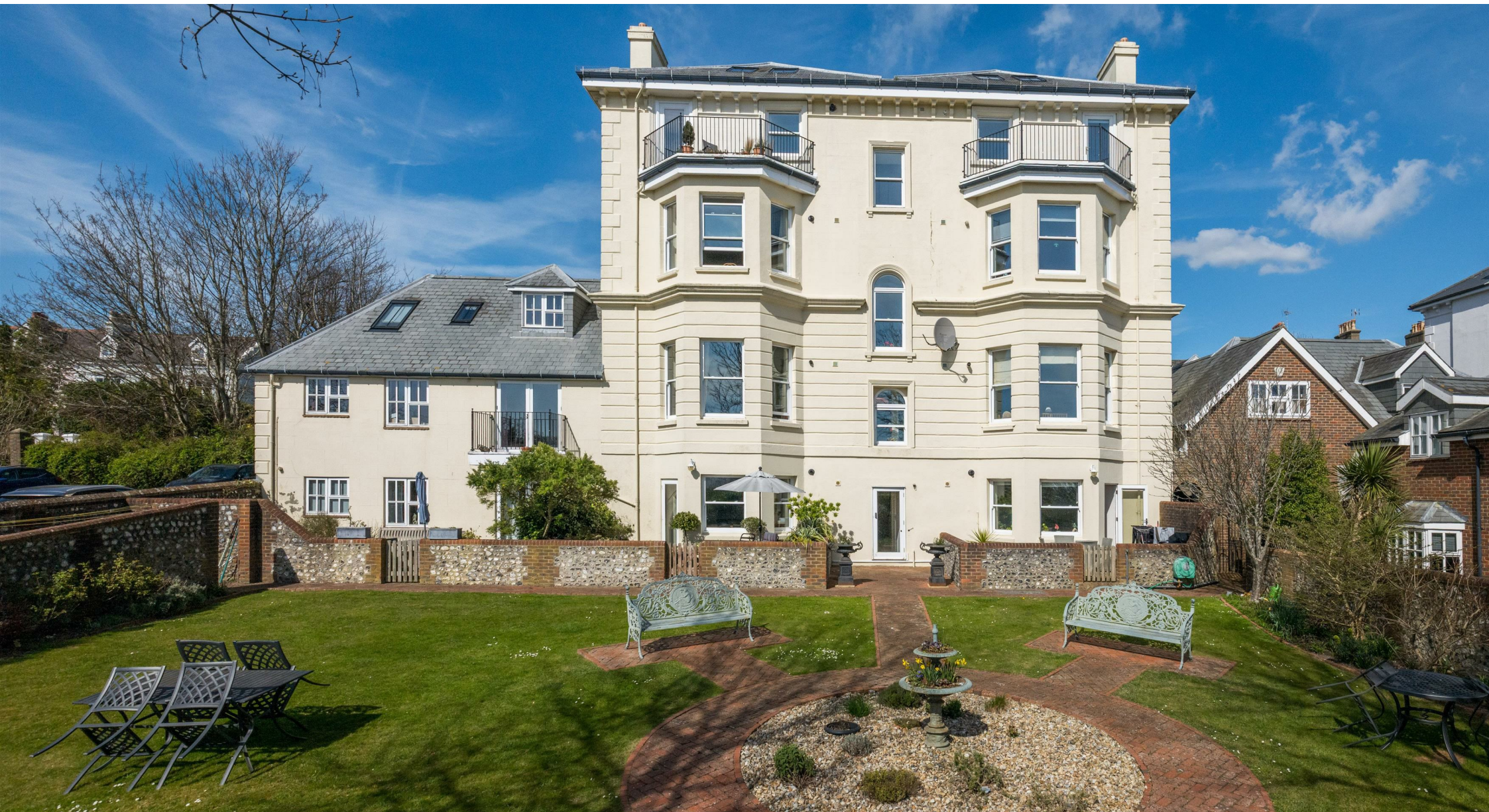
Southdown House, 44 St Annes Crescent